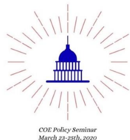
March 23-25th, 2020 Washington, D.C.